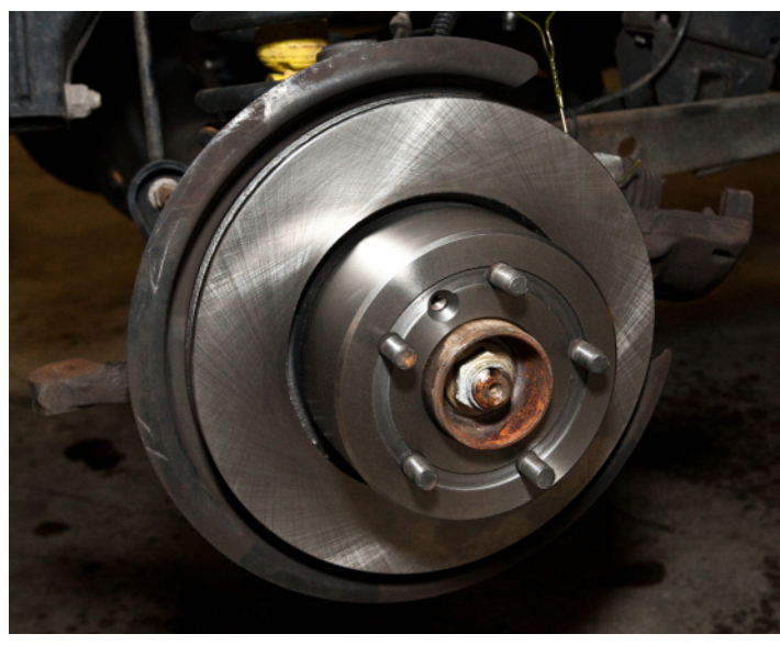
Step 12. After cleaned up, slide the rotor onto the wheel studs. It should be a tight fit so that it remains snug. Install caliper hangers over new rotors, torque 19mm, 12-point bolts to____.