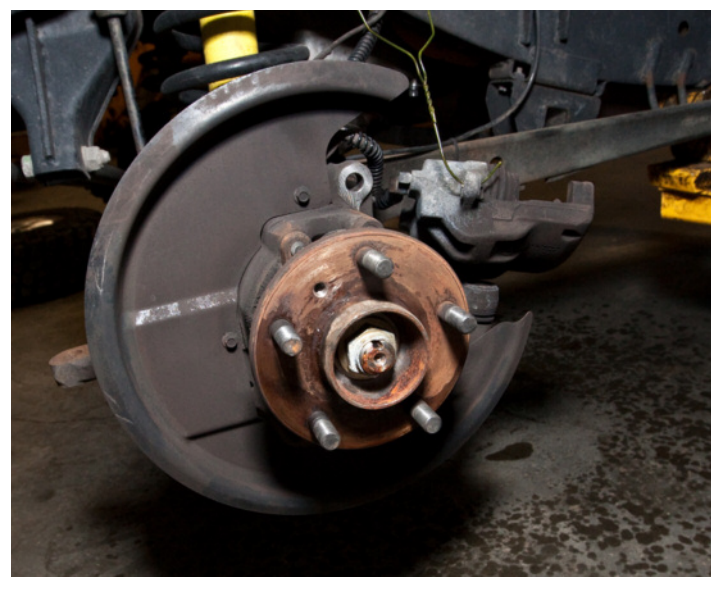
Step 9. Now that you have removed the rotor locating screw, and slid off the rotor by hand or with a rubber mallet, this is what you'll be looking at. It is important that when handling the new rotors you use gloves to make sure you don't get oil or grease on the new rotors.