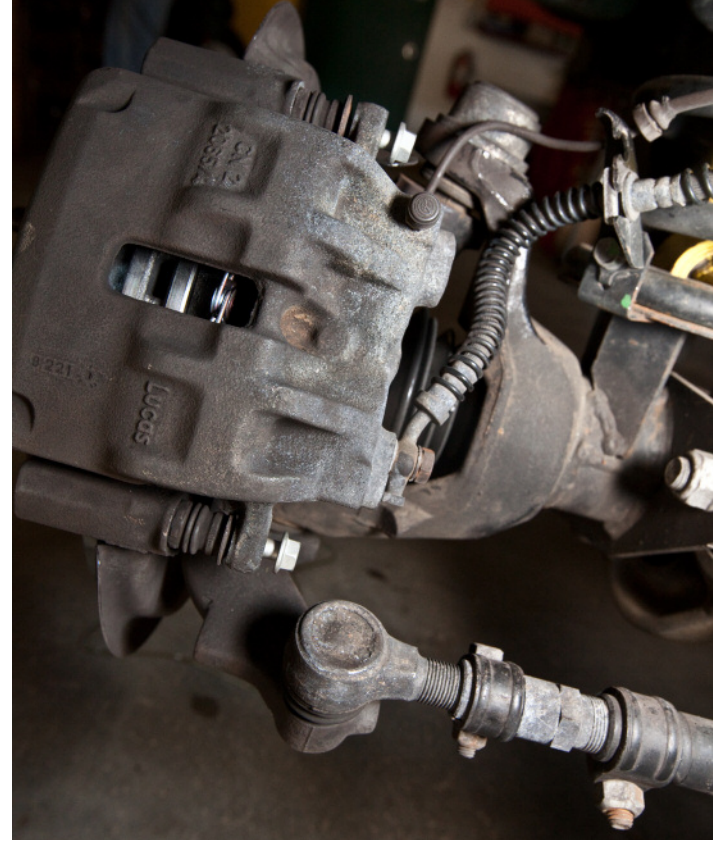
Step 13. Now complete the steps in reverse. Unscrew the brake fluid reservoir before compressing the pistons. You'll need a piston compressor, or some sort of clamp that can compress the pistons on the caliper(2) so you can slide the caliper over the pads on the rotors. after doing that, located on of the bolts on the caliper, and screw it halfway. Then insert the other caliper 12mm bolt, once located, torque both to ___

Note: It is important that you remember to depress the brake pedal a couple times before leaving the shop on an incline as the pistons have to reset. Double check brake fluid levels. After this is done, do several stops from about 60-15mph to properly bed the pads and rotors.