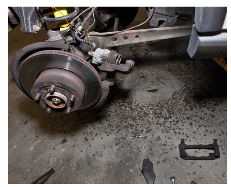
Step 7. Now that you have removed the bolts and caliper mount, you have access to the rotor. At this point, you'll have wanted to have sprayed the rotor mounting screw a few hours ago.