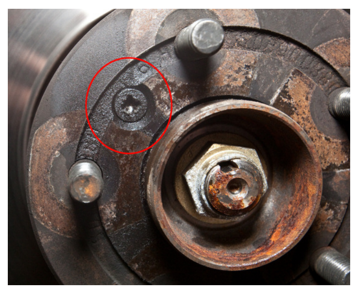
Step 8. Welcome to your worst nightmare. This little devil is the rotor locating screw, and it is the bane of my existence. For some reason, the one on my rotor hat was already stripped, so I didn't get it easy. The way I finally completed the removal, was by torching the screw and hammering a flathead into it. You may get lucky and get it out with a screwdriver, but I severely doubt it. Good luck with this step, it is painful.