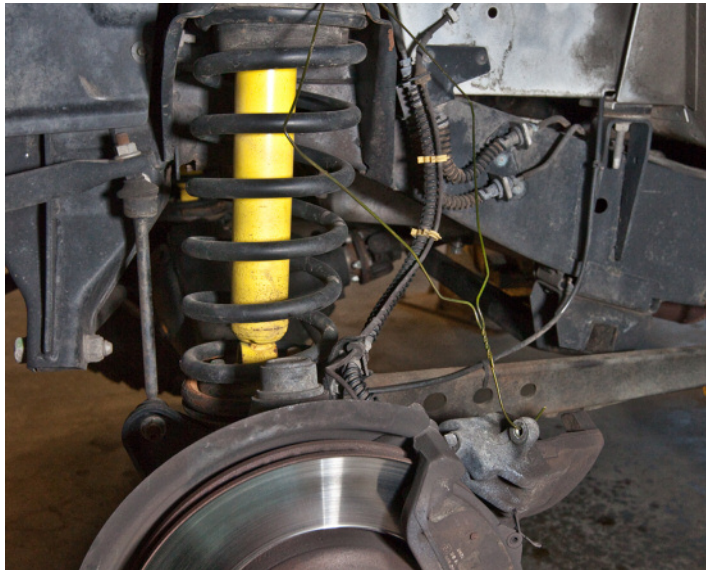
Step 5. It is important at this point to support the caliper itself. You do not want any stress on the brake line, it could cause damage and leave you in the shop for a lot longer. I used a coat hanger, but bungee cords are ideal for this.