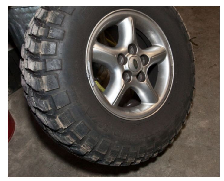
Step 2. Remove the rest of the lug nuts and remove the front wheels. I want to stress that this job does not require a large amount of tools and special skills, it is quite easy and can be done with a small selection of tools.