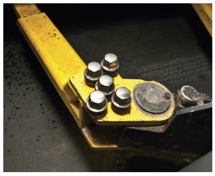
Step 1. Using a lift to do a brake job is quite ideal, although it can be done without one using jacks and jackstands. You'll want to break tension on the lug nuts before raising the truck in the air. Use a wrench instead of an impact drill to prevent damage to the lug nuts.