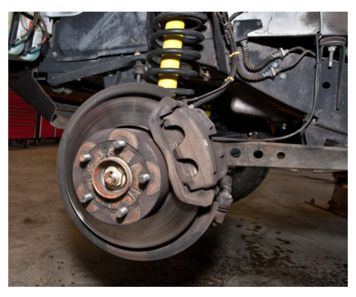
Step 3. For the majority of owners, the rotor hat and a few other bolts will be rusty. Ideally if you have the time, spraying PB blaster on all the bolts you plan on removing and letting it sit for a while would be ideal. I sprayed all the bolts and let it sit for about 20 minutes.