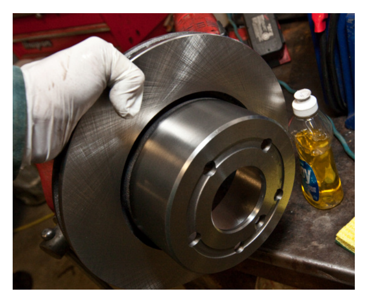
Step 10. At this point it is ideal to wash all of your rotors with either brake cleaner or dish soap and water. Make sure to clean it thoroughly to get rid of any soap or grease on the rotor.