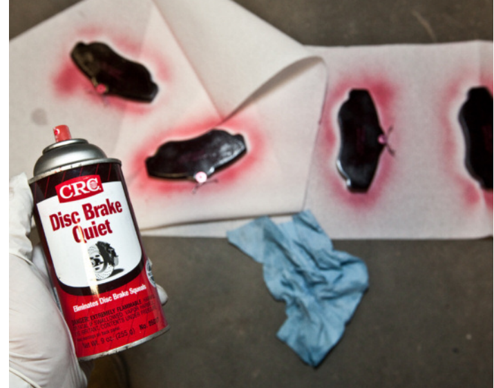
Step 11. Spraying your pads with anti-squeal spray or copper anti-seize paste is a good idea at any point of the install. Anti-squeal will have to dry, so it might be best to clean around the hub while it is drying.