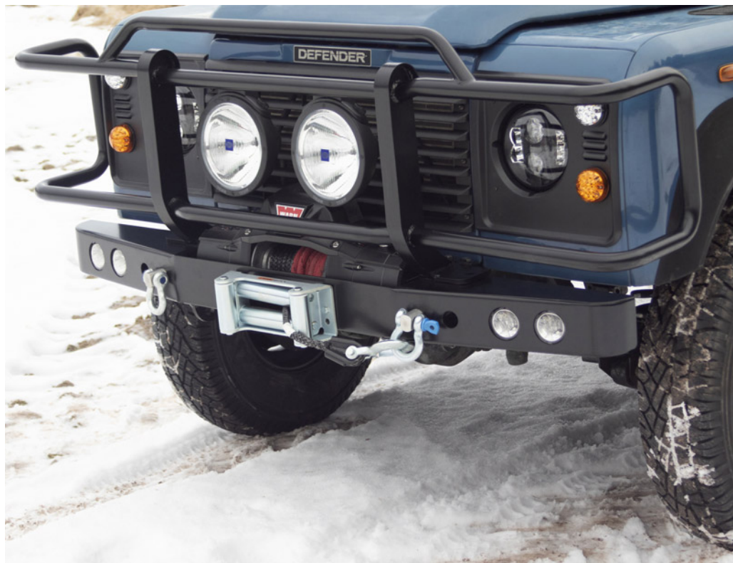
RNA2109 shown above with optional Brush Guard, Winch, Recovery Points, and Hella Rallye 4000 Lights

READ ALL INSTRUCTIONS COMPLETELY BEFORE BEGINNING!