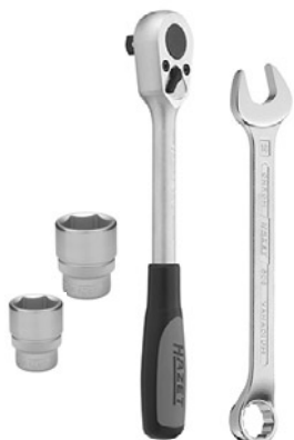
Various Sockets, Wrenches