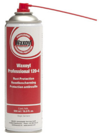
Waxoyl 120-4 Rust Inhibitor (Part# RNW5004)