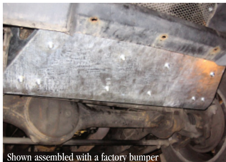
Shown assembled with a factory bumper