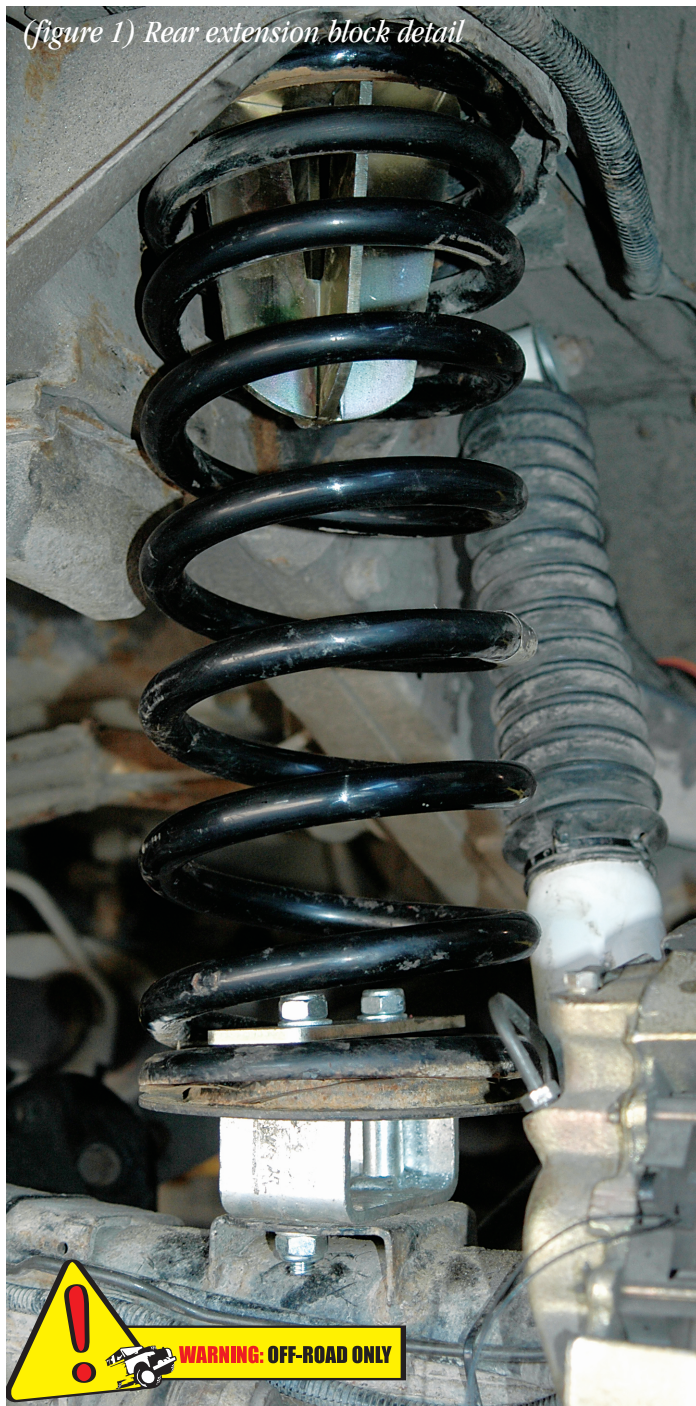
(figure 1) Rear extension block detail