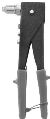
Pop Rivet Gun