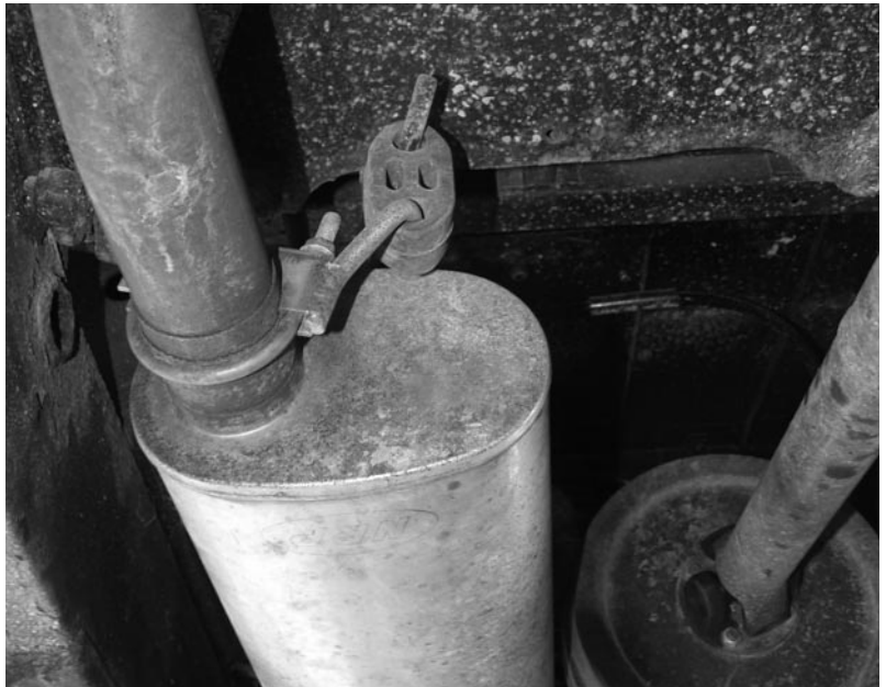
Photo 1. Front Hanger

Replace front OEM body hanger with body hanger supplied with exhaust. Front hanger is located behind the muffler. It clamps the rear section to the muffler and supports the exhaust using the OEM rubber hanger.