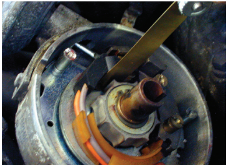
Figure 2. Insert feeler gauge into air gap area to obtain .010 clearance.