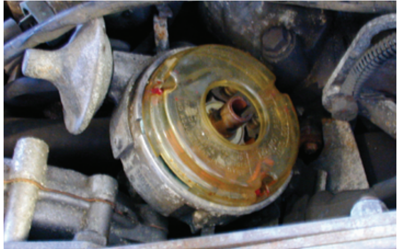
Figure 1. Dust cover screws are marked with red paint - don't loose them!

5) Start the engine, and with the proper Allen wrench, adjust the idle RPM by turning the screw clockwise to decrease RPM or counter-clockwise to increase RPM, see figure 3. The